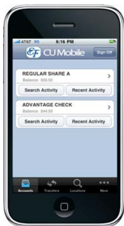
Downloadable App for iPhone and compatible Smartphone