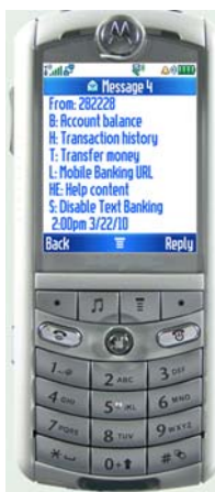
SMS Text from most any phone.